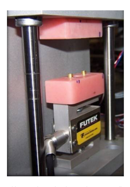
Fig. 4. Load cell Futek S shape, model Futek<sup>®</sup> LSB 300,

(A) Portable computer; (B) Motor; (C) Support for the acrylic blocks linked to the load cell.