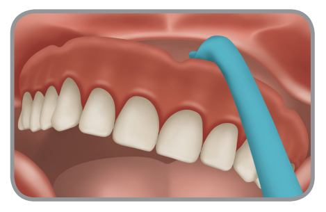
Use handle of tool to pull down to disengage the overdenture.

Insert removal edge under flange of denture.